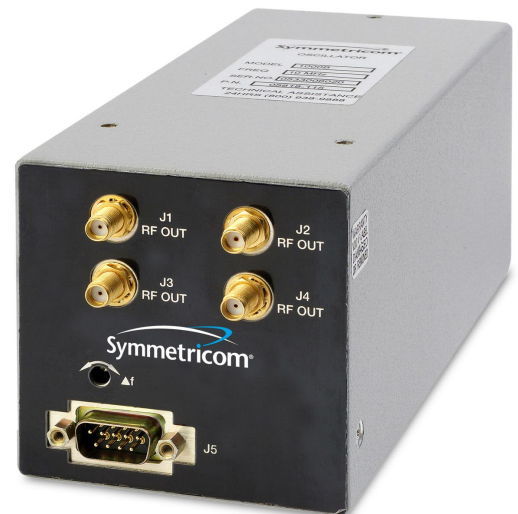
1000B Ultra-Stable Crystal Oscillator

Linearized electronic frequency control allows the use of servo loop techniques for fine frequency tuning. Linearity is better than 5% over the specified tuning range. The 1000B crystal oscillator meets the demands of a wide range of applications for military and industrial environments. The oscillator is found in precision frequency counters and synthesizers, GPS receivers, microwave multiplier chains, phase noise calibration test equipment, Stratum II telecommunications applications, radar and tactical communications systems, secure communications systems, satellite ground terminals and space flight systems.