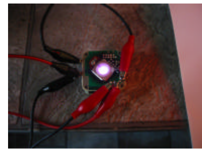
Figure 2, proper Rb ignition